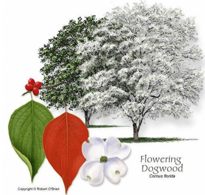
Flowering Dogwood Cornus florida